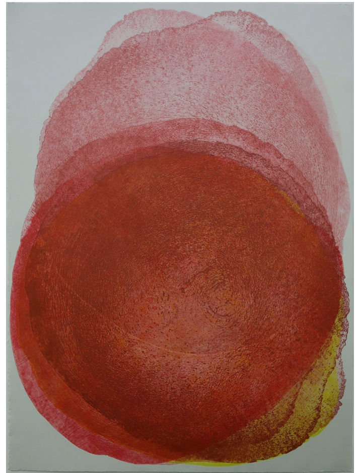
Pia Larsen, Origin, 2024, printmedia on paper, 76cm x 57cm, U/S